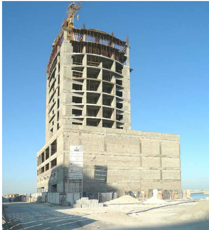
Figure 8. Integrated multi-story car park at a construction site of a residential high-rise in Manama's Juffair district.

Due to the increasing deficit of parking spaces within districts, recent high-rise projects have begun to integrate multi-storey car parks with up to six floors. This is leading to an even more pedestrian-unfriendly urban environment and reduced potentials to integrate services in ground floors (Figure 8). Thus, despite the development trend of including certain services in new projects, such as the Nomas Towers in Juffair, large parts of the new districts do not integrate commercial or social facilities. In addition to missing land-use integration, the lack of public transport is leading to increasing congestion. The rapid growth has also had an impact on the electricity supply, the capacity of which has been exceeded in certain areas. This shortage of supply is due to an evident lack of impact studies and planning in addition to an absence of restrictions and their