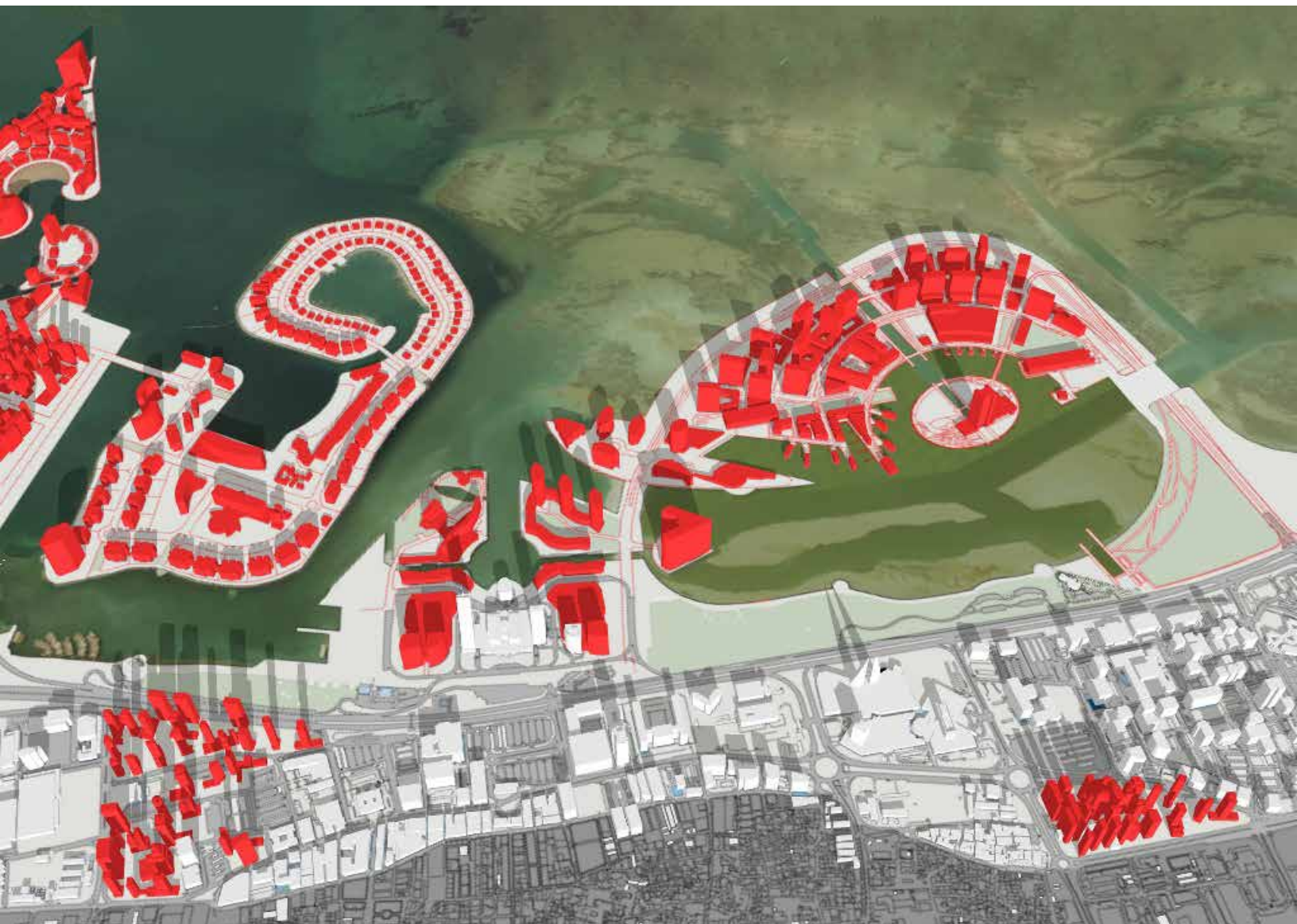
Figure 9. The future development sites of residential developments.

The supply of an efficient urban structure, is to a large extent the result of the implementation of guidelines and regulations related to policies and physical planning in combination with public investment in certain development strategies such as public transportation. In general, it can be stated that an efficient urban structure relies on a balanced distribution of urban densities: a high level of land use integration and an efficient