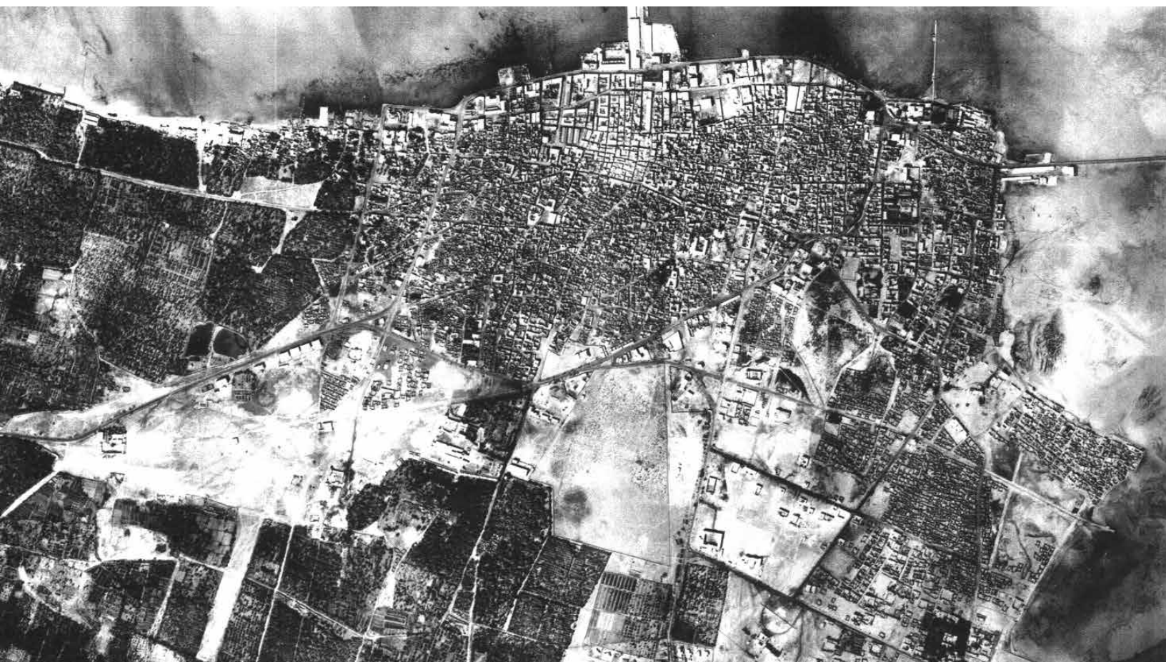
Figure 3. The historic settlement of Manama in 1957.

In 1960, the urban area of Manama was concentrated on an area of less than 4 square kilometers along the North-Eastern shoreline of Bahrain's main island (Figure 3). At this time the outskirts in the South were still occupied by agricultural areas and small rural settlements. Although large areas of land were undeveloped, they were reclaimed along with the coasts in the North and East; where the first causeway was built, linking Manama and Muharraq. After Bahrain gained independence and Manama was made the new capital, more areas were reclaimed along the Northern shoreline in order to expand the country's first central business district and to develop a modern administrative center. During the 70's, when the old harbor area was in the process of transforming into a modern CBD,