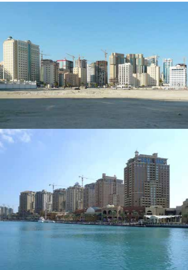
Figure 1 and 2. The two categories of high-rise developments in the Gulf region: Cluster developments and master planned projects along waterfronts in Bahrain (Figure 1) and Qatar (Figure 2).

Regarding the first category, the competitive aspect of the private sector, (which has taken over the main direction of the current urban development), is leading progressively