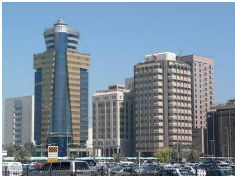
Figure 7. The high-rise cluster in the Diplomatic Quarter.

The majority of residential high rises along the coasts of Manama were developed with an average building height of more than twenty storeys between 1998 and 2008. This transformation from medium-rise urban fringes to