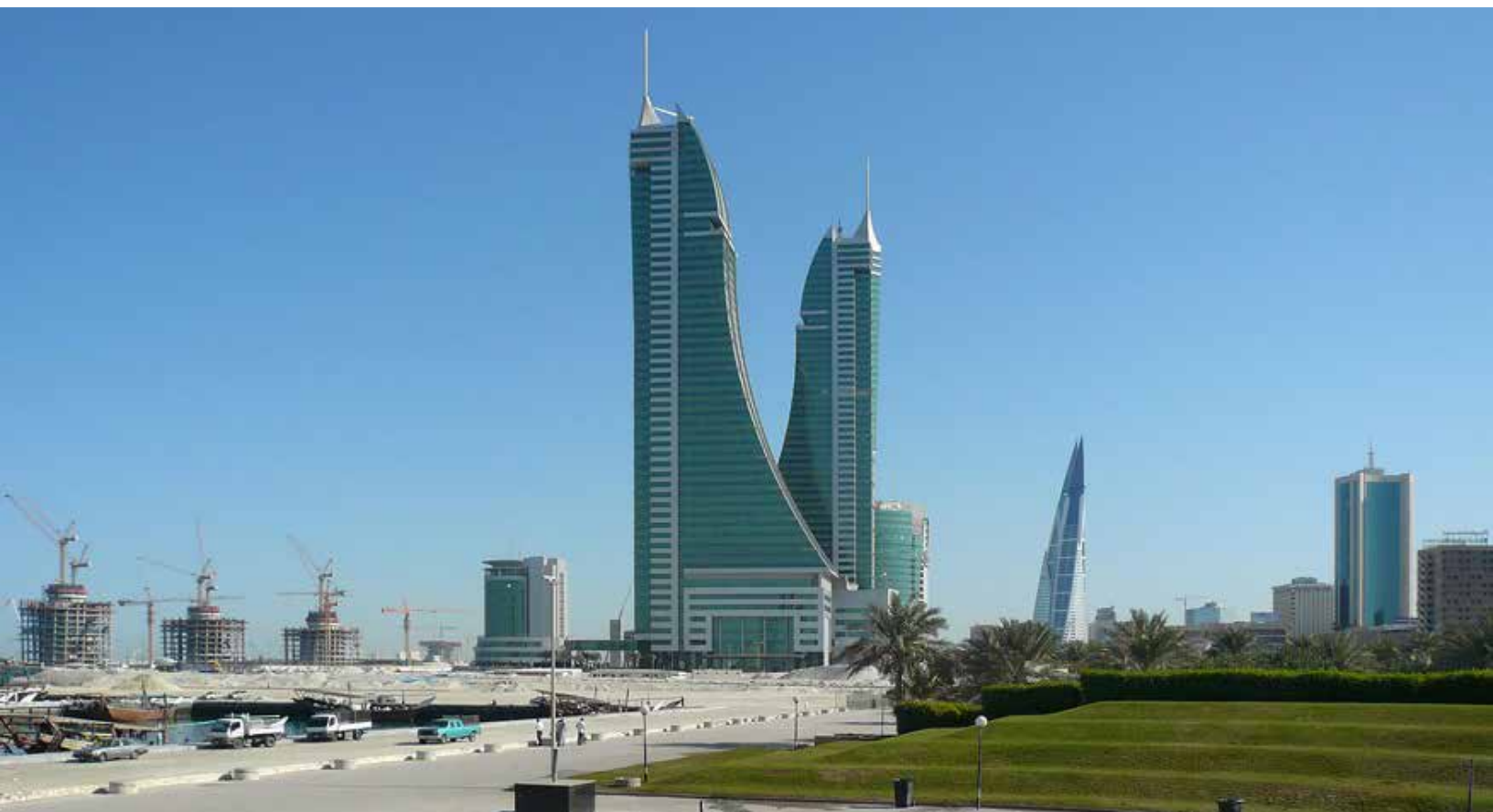
Figure 6. The Bahrain Financial Harbour.

will be launched. All the residential projects will comprise around 10 towers with up to 50 storeys. It is currently expected that about 7,000 people will reside in the Bahrain Financial Harbour and around 8,000 workers are expected to come and go daily after its completion (BFH, 2009).