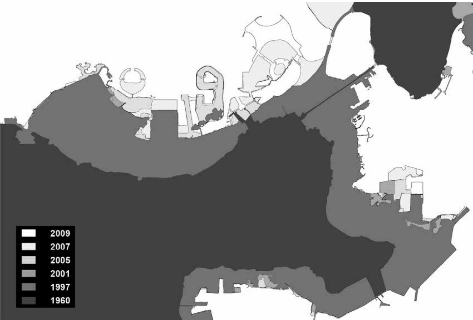
Figure 4. The land reclamation in Bahrain's capital Manama.

In the North of Manama Government Avenue marks the former coastline, which was shifted more than 300 meters by the reclamation of an area of around 2 square kilometers in the middle of the 20th century (Figure 4). Consequently many: shops, banks and hotels in addition to offices and administrative buildings were developed along both sides of this important access road. While in the west the Central Market at the Pearl Roundabout marked the end of Manama's Northern business district, the